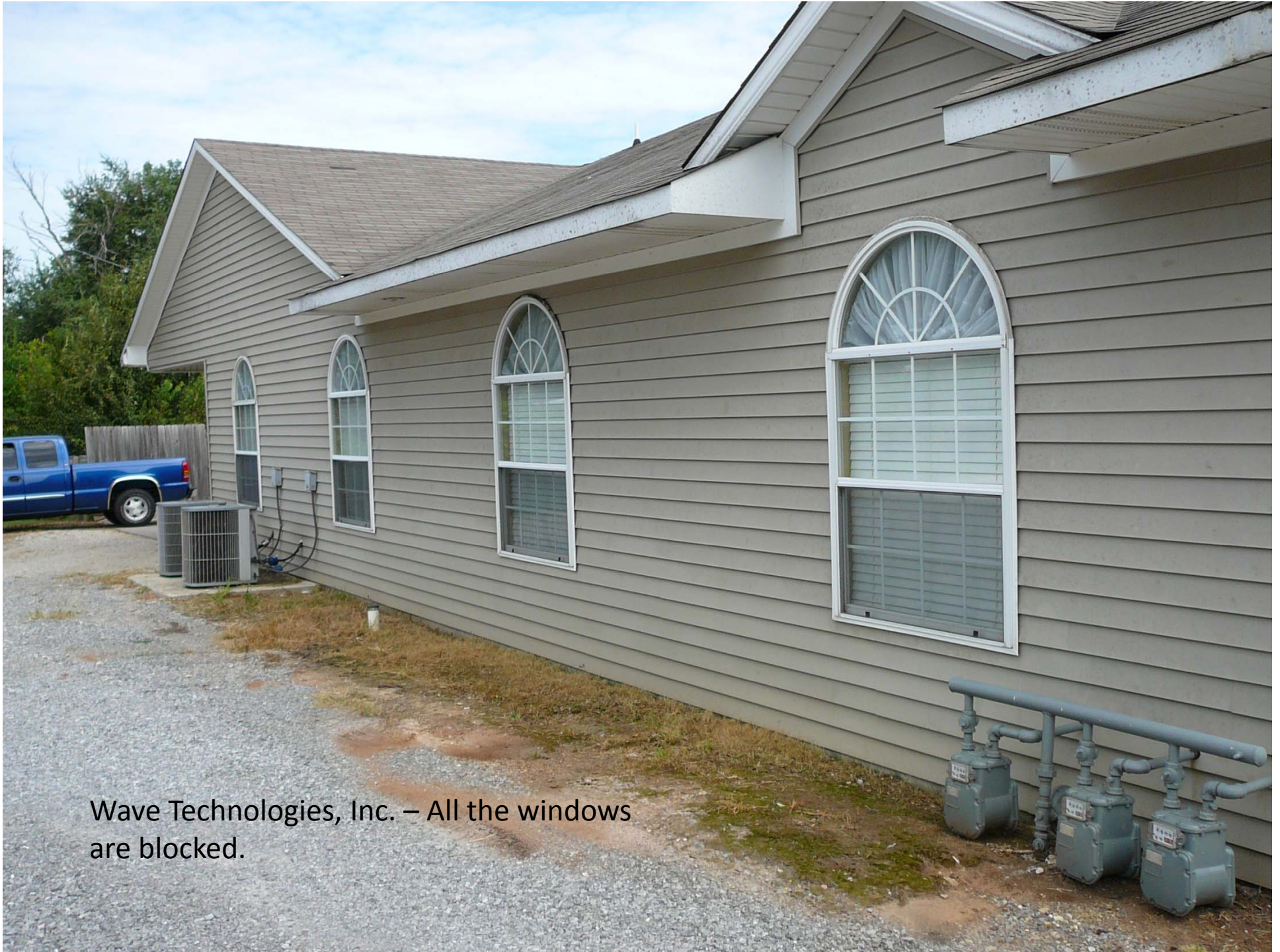
Wave Technologies, Inc. – All the windows are blocked.