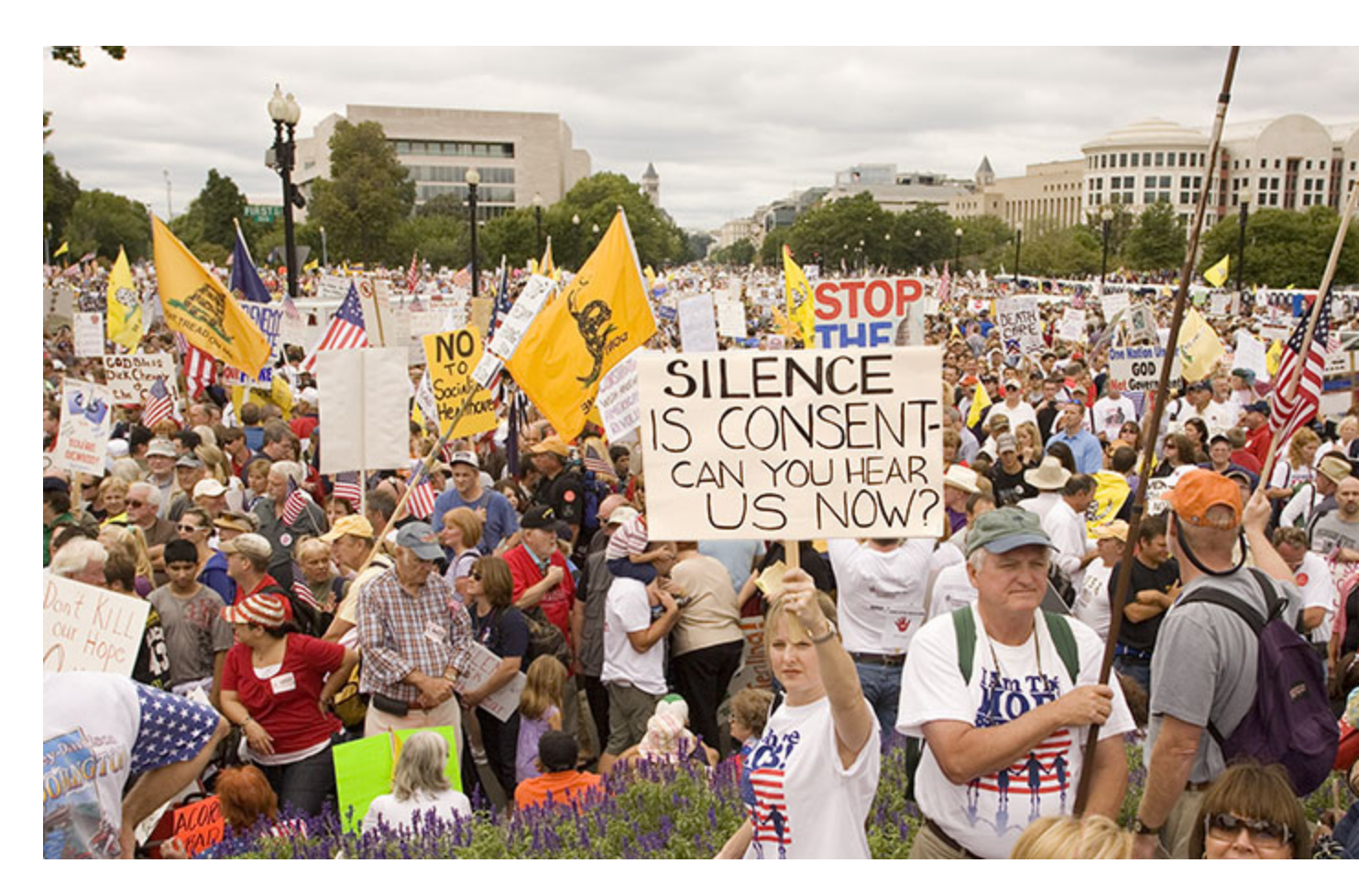
In the very center of the photo, above the Silence is Consent – Can You Hear Us Now sign, you can see Pennsylvania Ave., which at this time is totally blocked with protesters who cannot move forward to the Capitol area. Sorry, full up.