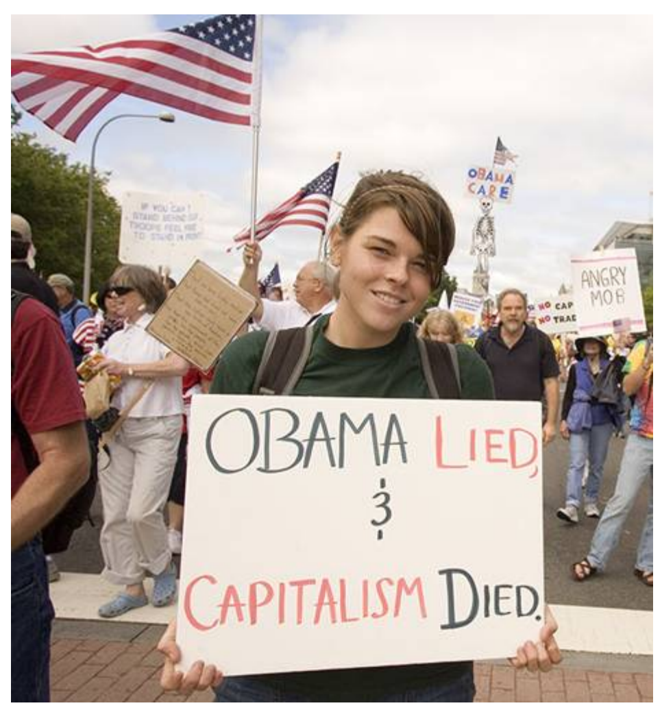
Obama Lied, Capitalism Died.