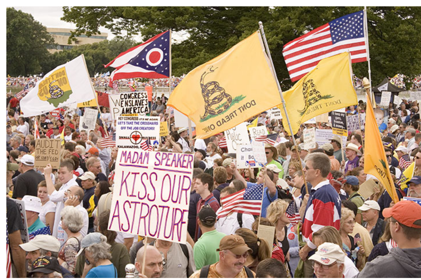
Madam Speaker: Kiss Our Astroturf!