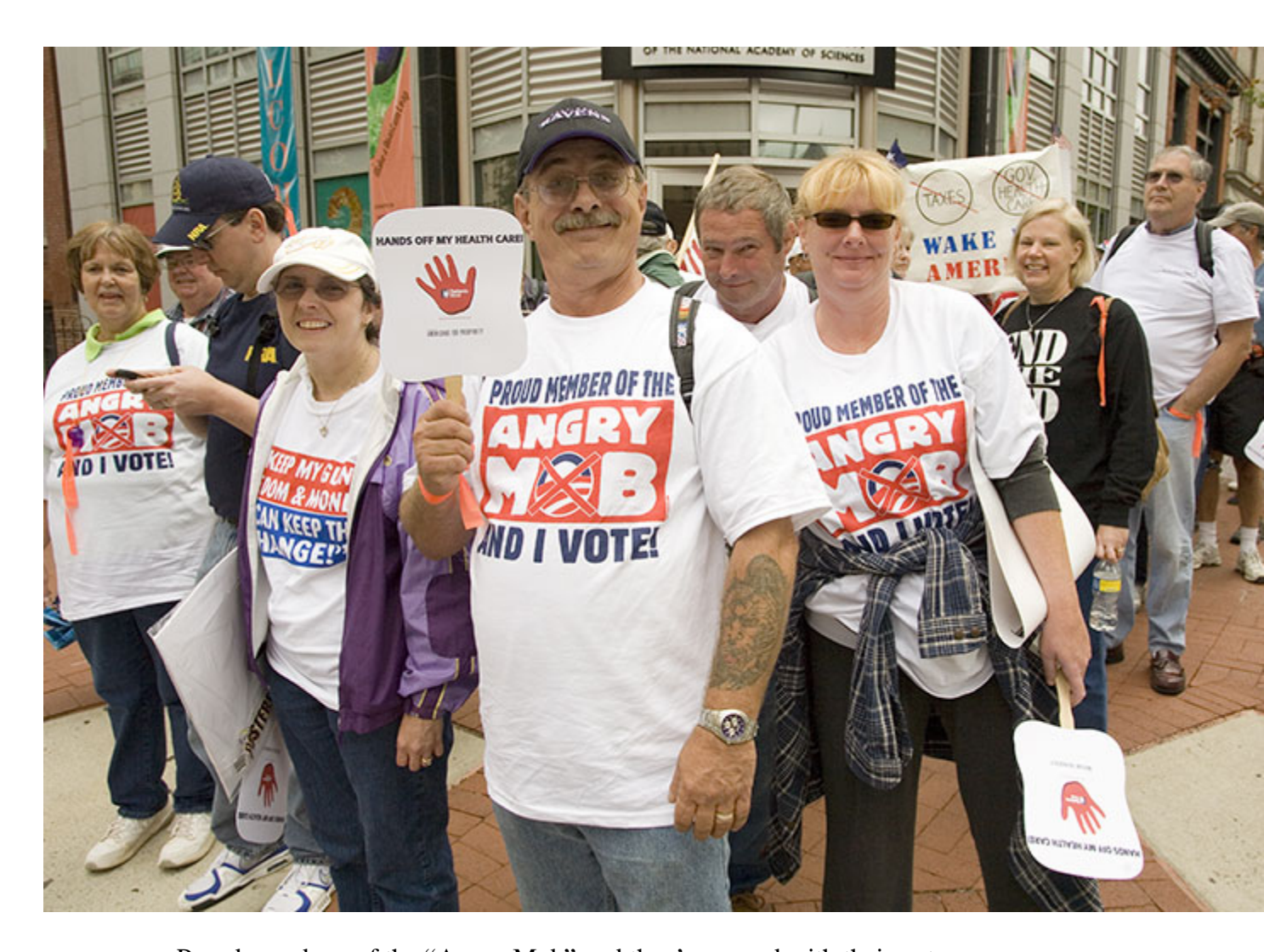
Proud members of the "Angry Mob" and they're armed with their votes.