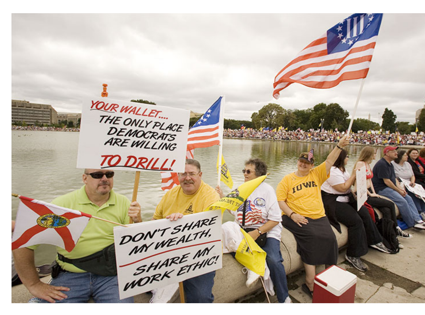
Your wallet...the only place Democrats are willing to drill! - Don't share my wealth - share my work ethic!