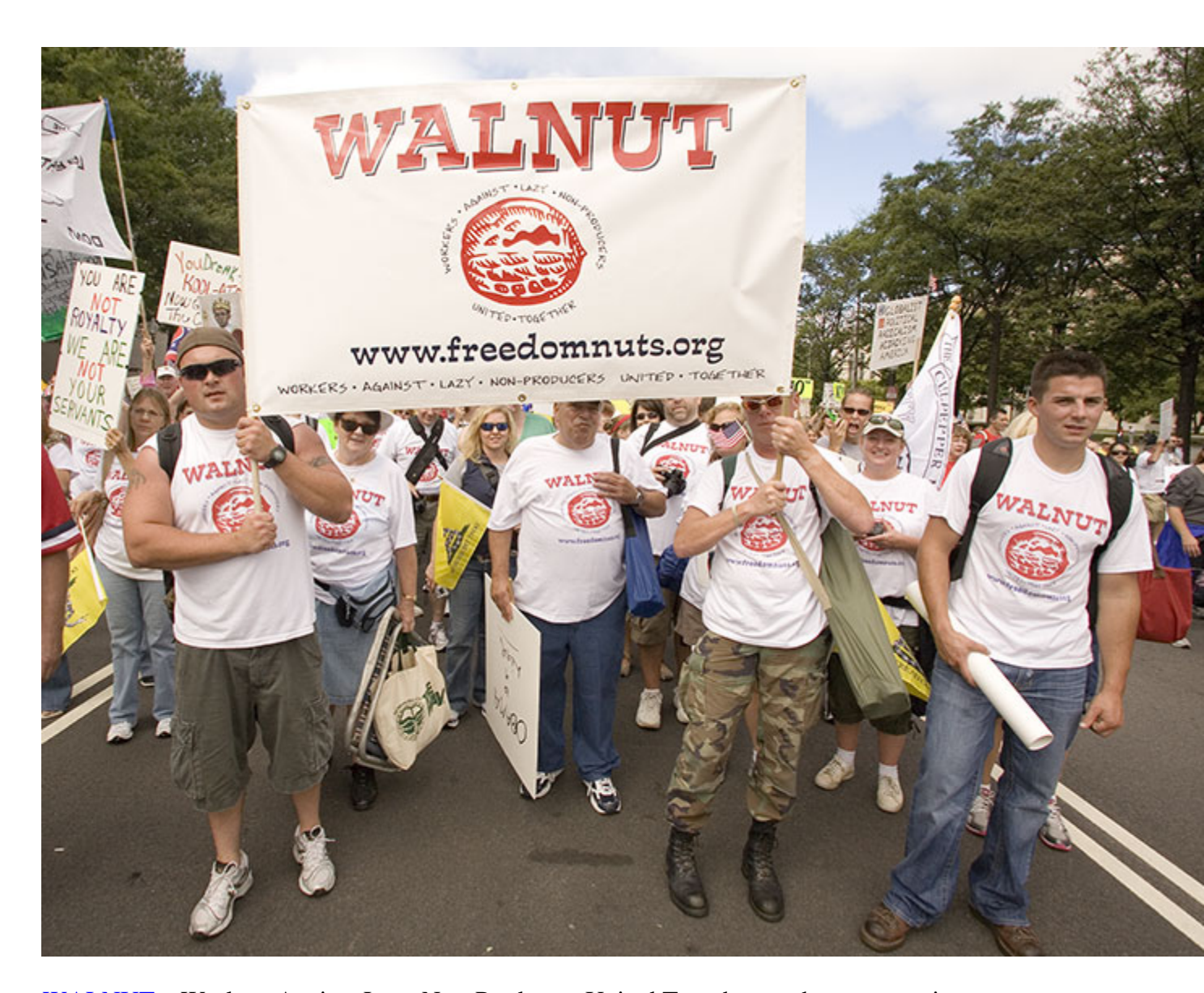
<u>WALNUT</u> – Workers Against Lazy Non-Producers United Together — the conservative answer to ACORN. Didn't have to ask them if they were receiving any taxpayer money like radical leftwing ACORN. Different DNA!