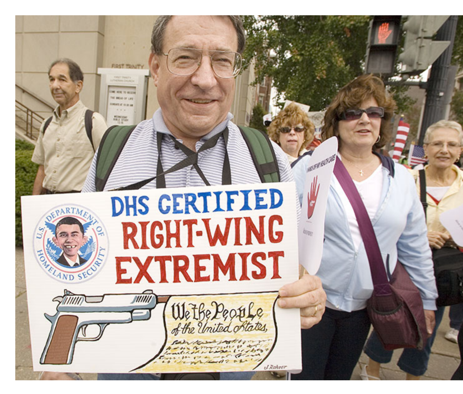
Right-wing extremist armed with the constitution.