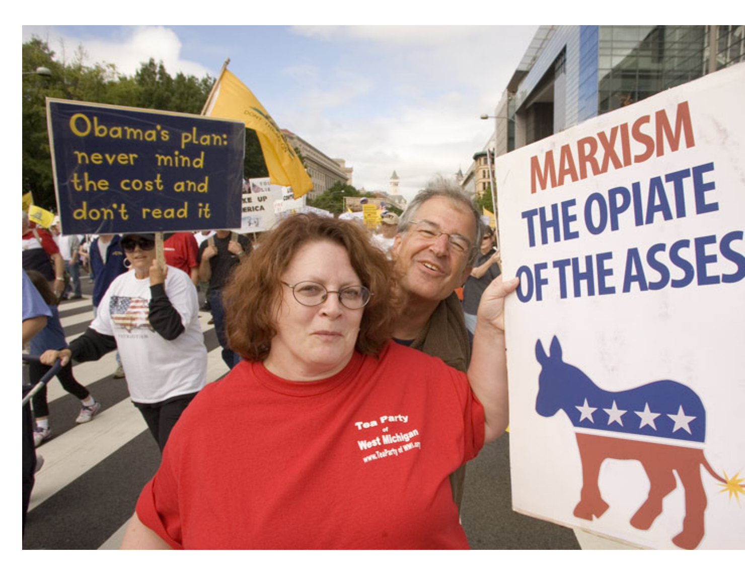
\label{eq:marxism} \mbox{Marxism-- the opiate of the asses-- Posters from the $\mbox{\sc Peoples Cube}$ are proliferating amongst protesters.}