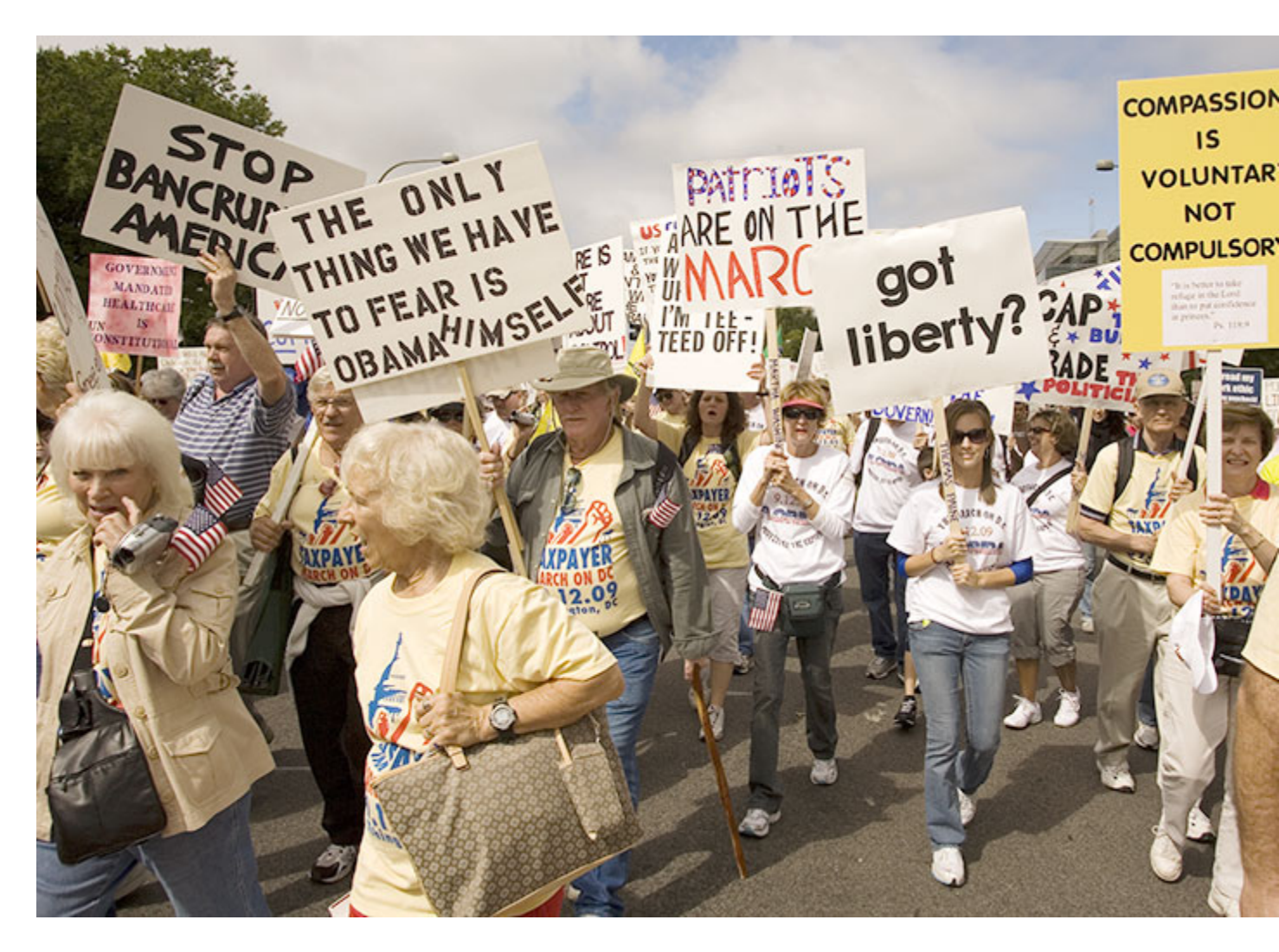
The Only Thing We Have to Fear is Obama Himself Compulsory!