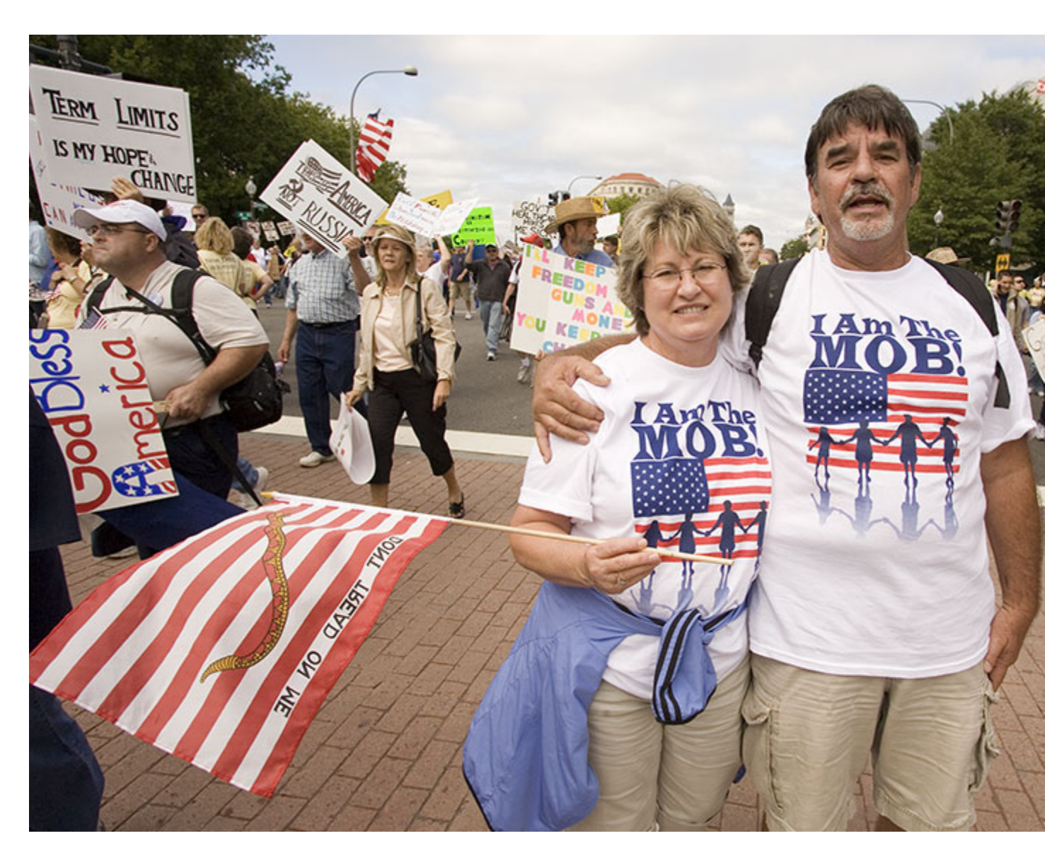
We are the mob!