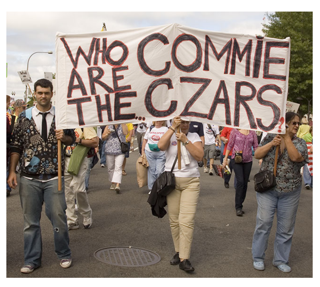
Who are the commie czars?