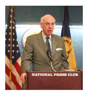
Sen. Bob Bennett |

There has been a lot of discussion about the activity of the German presidency of the European Union with respect to creating a barrier-free economy between the European economy and the American economy. This is not a free-trade agreement (FTA). FTAs seem to carry