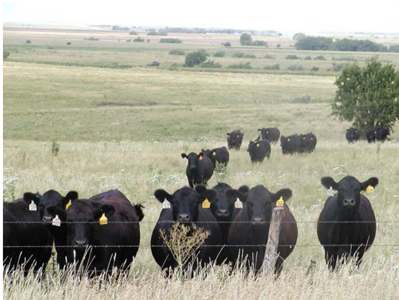
Animal identification is not a new concept. In the United States, many animals are already identified through eartags, brands, or tattoos. The NAIS will help standardize animal identification at the national level for all animals of a given species.

NAIS integrates smoothly within all three of its sponsoring organizations.