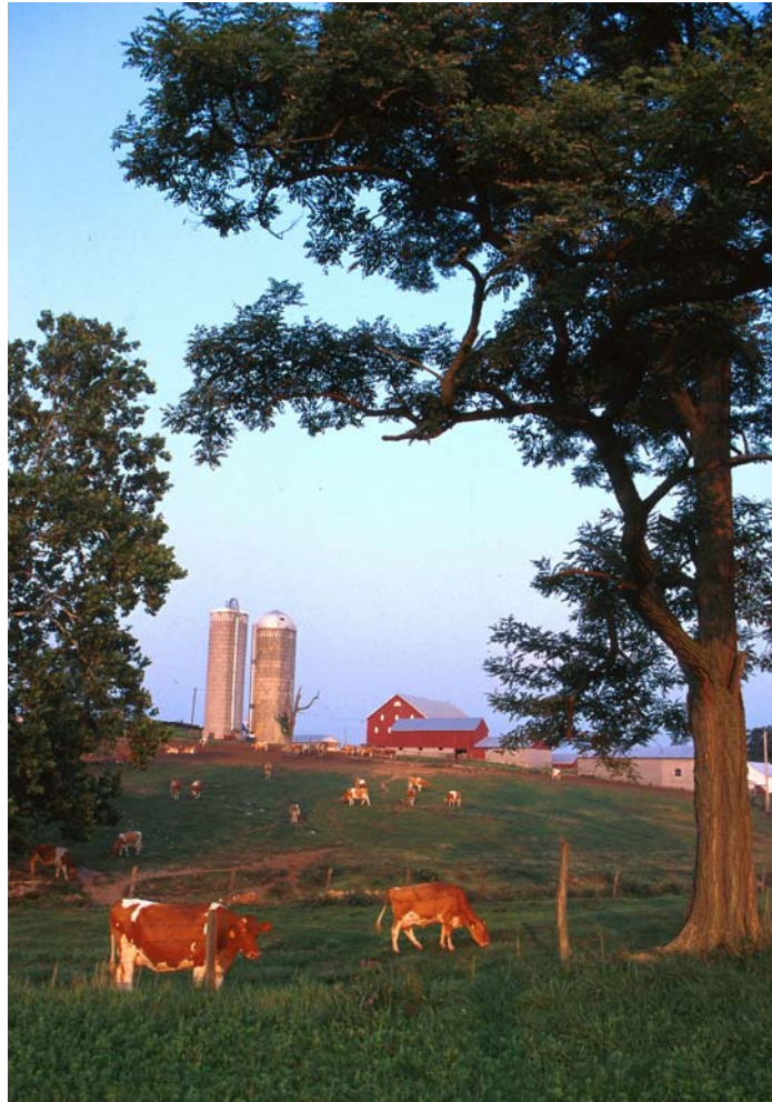
Under the proposed plan, all locations that hold, manage, or board animals will be required to have a unique Premises Identification Number by January 2008.