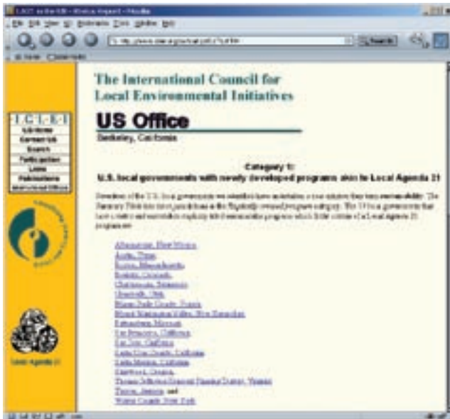
Image 2: The International Council for Local Environmental Initiatives – 1997 report

Essentially, Sustainable Development claims knowledge of all sustainability issues and has stock solutions that can be applied in Stockholm, Boulder, Santa Cruz – indeed, anywhere.