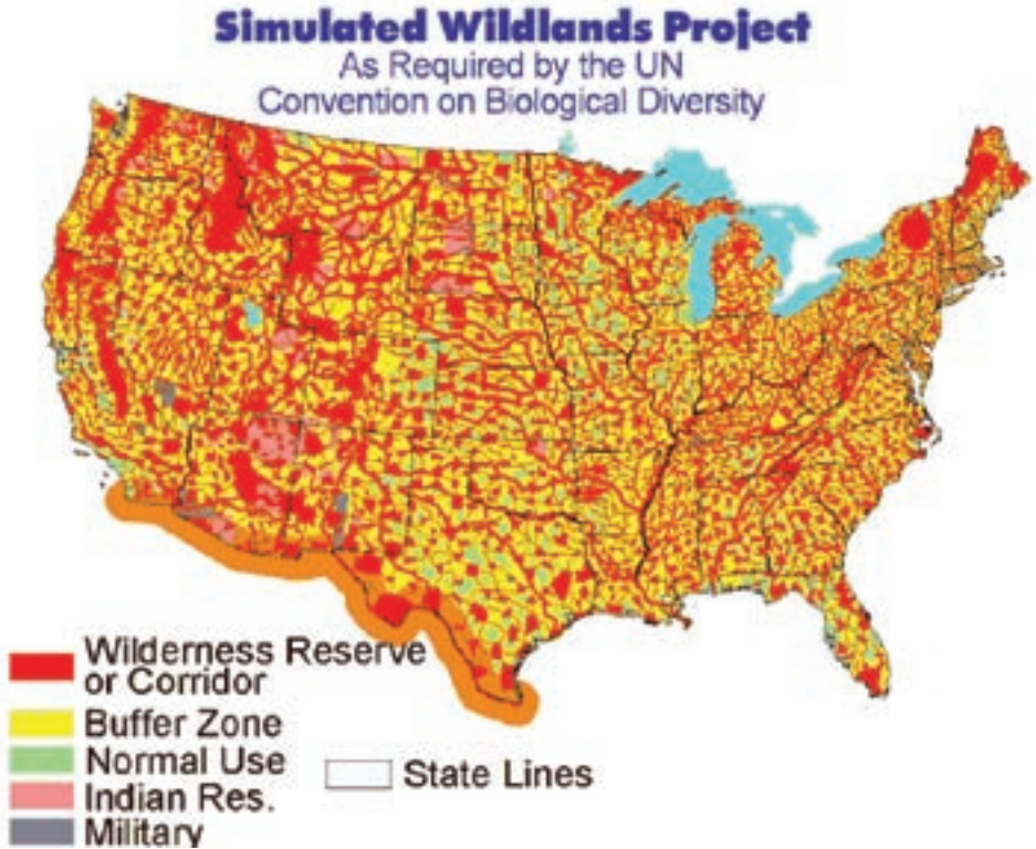
Image 3: Simulated Map of The Wildlands Project, showing land designated off-limits to all human activity (red).