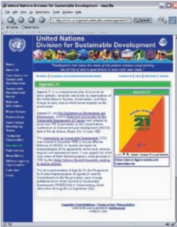
Image 1: The United Nations website clearly displays Agenda 21 documents

known as the Rio Earth Summit, where more than 178 nations adopted Agenda 21, and pledged to evaluate progress made in implementing the plan every five years thereafter. President George H. W. Bush was the signatory for the United States.